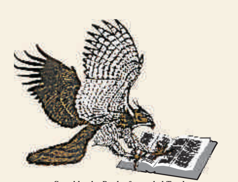
Stand by the Rock of revealed Truth. It makes the difference! Matt. 16:15-18

potential to be so great, because God lifted them up, just like He lifted up this young prophet out of obscurity into the limelight. And God could have lifted him even higher! Only God knows the height God could have lifted him to. But he didn't understand he had to be faithful, appreciating God's Word. And this old prophet too, the evil that ruled and ruined his life never left him: Ambition! Ambition! He wouldn't let it go. I have to say this morning: It is good to have ambition, but a man should have enough sense to know this, and to understand this, being men in the ministry, that a man's ambition must be tempered by revelation, and by the will of God. Two things: It must be tempered by the revelation of God's Word, and by the will of God. The material question which a person nursing an ambition in the ministry must ask: What is God's will? Because we are not called